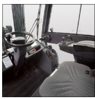
Workstation is comfortable and helps to maximise productivity