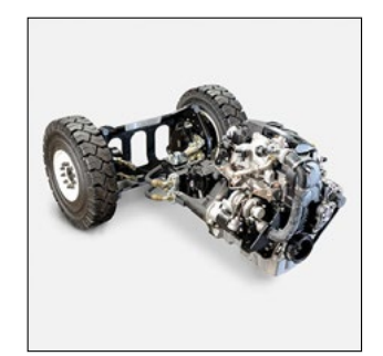
VW engines with low energy consumption