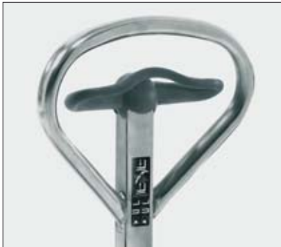
AMX I10 control