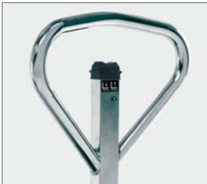
AMX I10e control