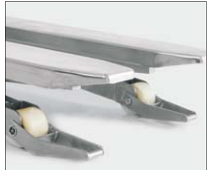
Enclosed fork tips