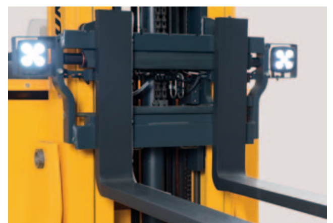
Spotlights on the fork carriage provide best lighting conditions