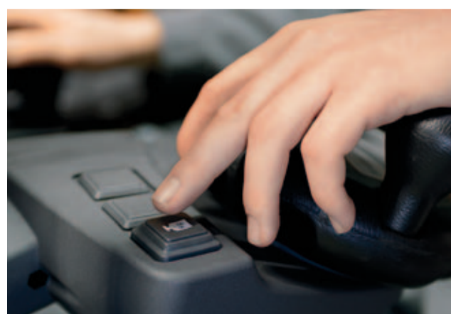
Weight control at the touch of a button