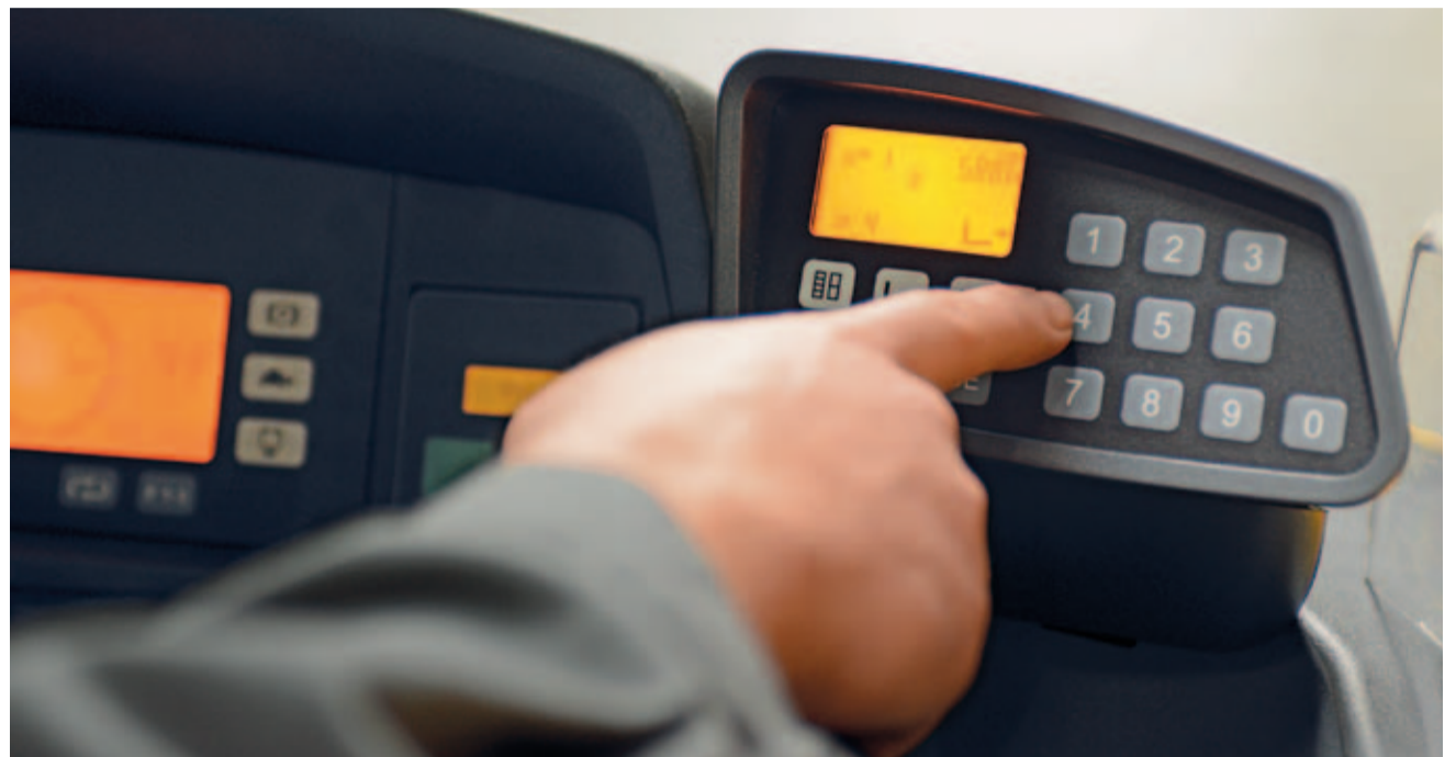
Simple, fast and reliable stacking and retrieval with Position Control.