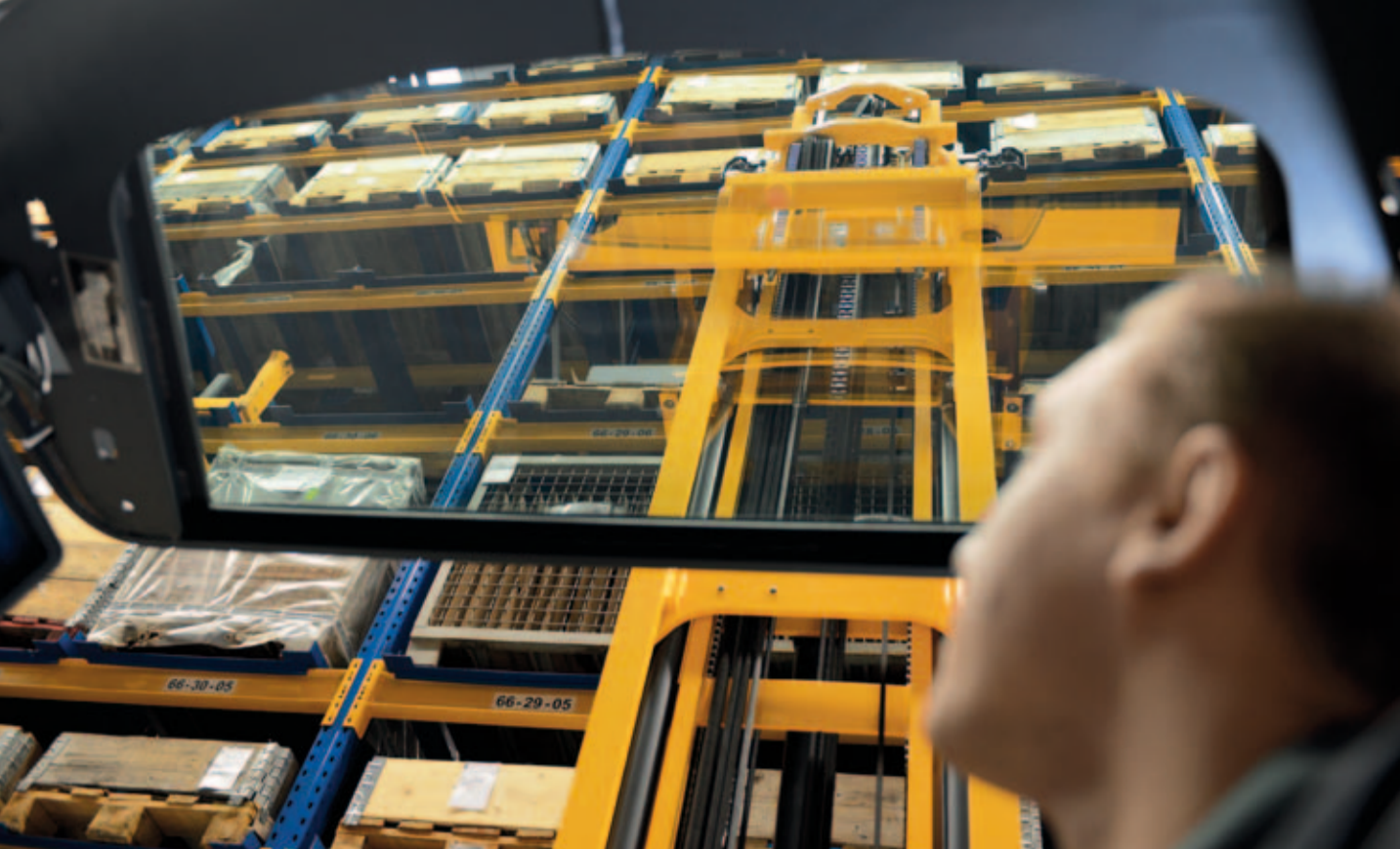
Clear view through panorama roof panel