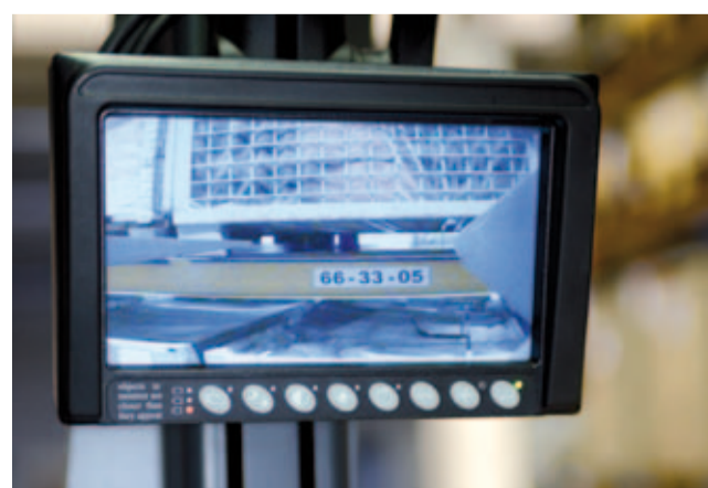
Stacking/retrieval with video monitoring

In dark applications, spotlights on the left and right sides of the fork carriage provide the best visibility, even at high lift heights. The lights are automatically switched on by activating a hydraulic function.