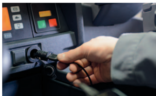
12 V socket in dashboard